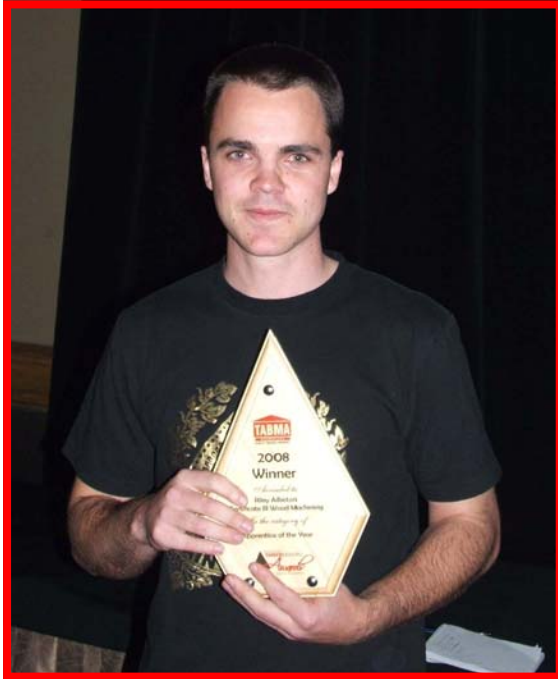
Certificate III Wood Machining (Furnishing) Host Employer: Stairco Qld