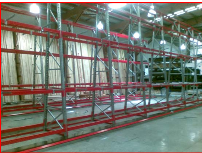
The engineered and certified Macrack system installed to replace the timber A-Frame racking.

Contact details for Macrack: PO BOX 2227 40-42 Devlan Street MANSFIELD QLD 4112 Ph: (07) 3343 9788 Email: sales@macrack.com.au Web: www.macrack.com.au