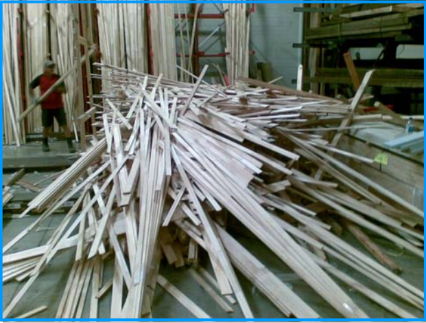
The aftermath of the A-Frame collapse. Fortunately nobody was injured in the incident.